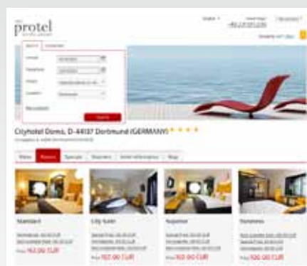
The room selection: hotel booking as a shopping experience