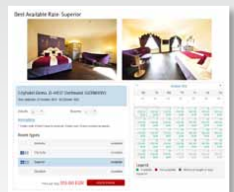
„Best Available Rate“ with various offers at your disposal